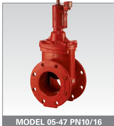
MODEL 05-47 PN10/16